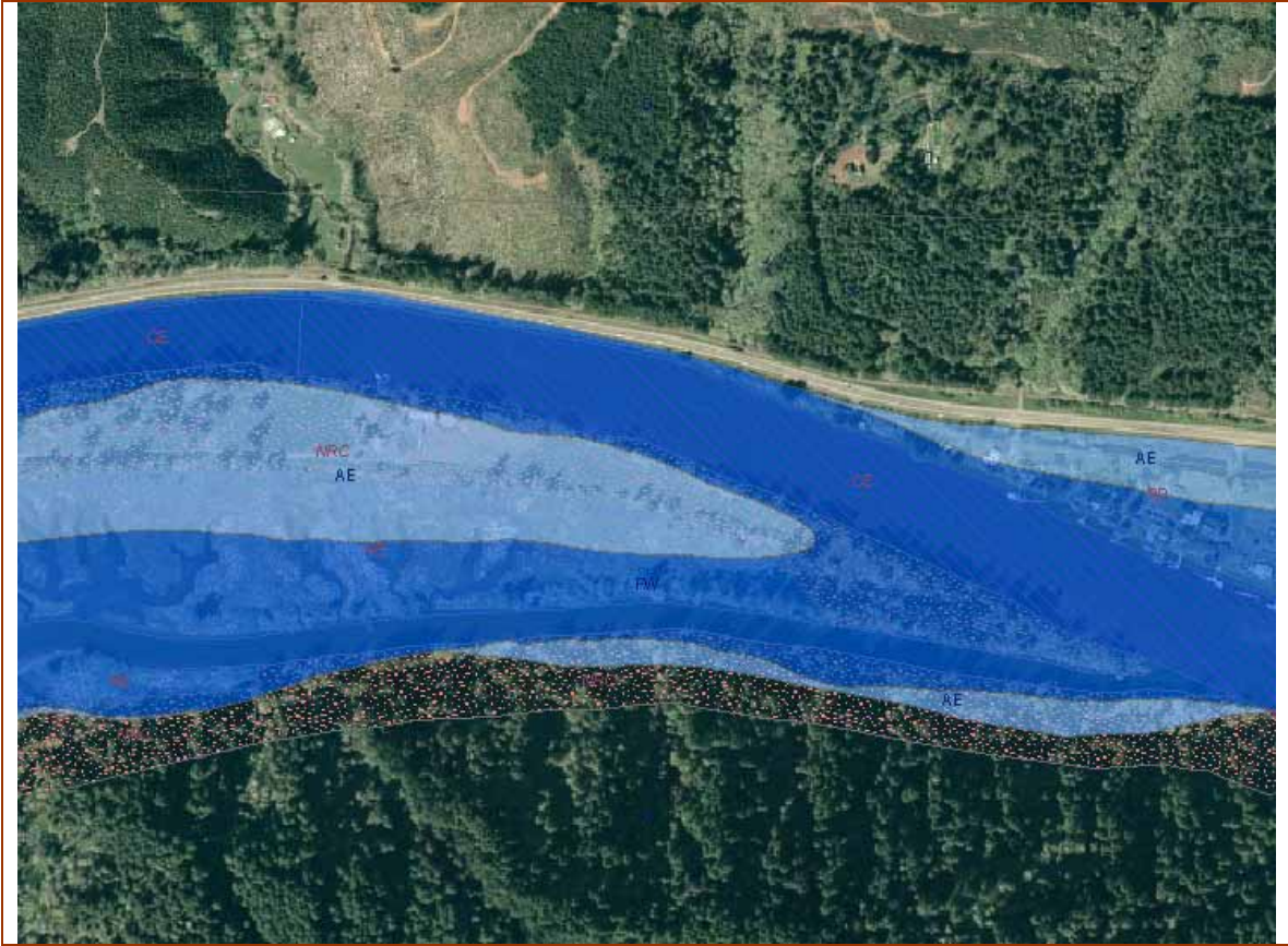
Vicinity of DMDP Site 36 - Coastal Resource Management Plan zoning designations.