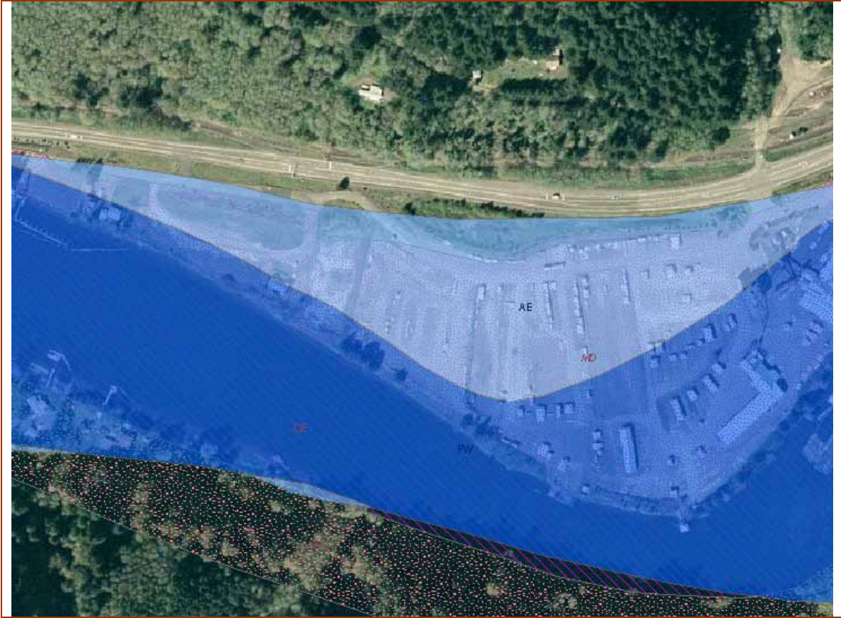
Vicinity of DMDP Site 40 - Coastal Resource Management Plan zoning designations.