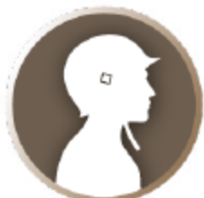
ESF 13 Military Support