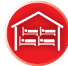
ESF 6 Mass Care