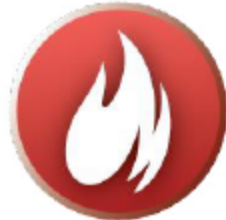
ESF 4 Firefighting