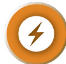
ESF 12 Energy