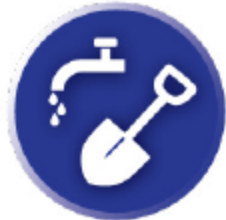
ESF 3 Public Works