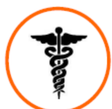
ESF 8 Health and Medical