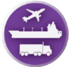
ESF 1 Transportation