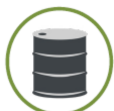
ESF 10 Hazardous Materials