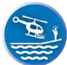
ESF 9 Search and Rescue