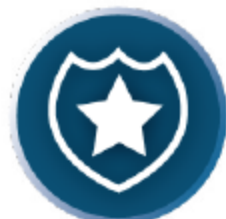
ESF 16 Law Enforcement