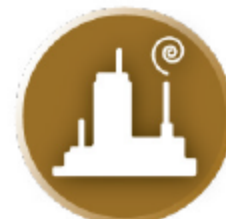
ESF 18 Business and Industry