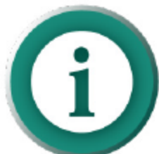
ESF 14 Public Information