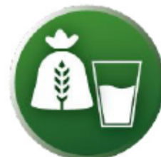
ESF 11 Food and Water