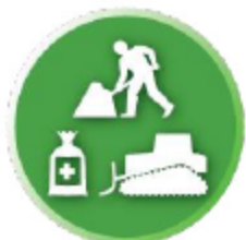
ESF 7 Resource Support