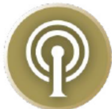
ESF 2 Communications