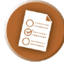
ESF 5 Information and Planning