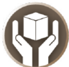
ESF 15 Volunteers and Donations