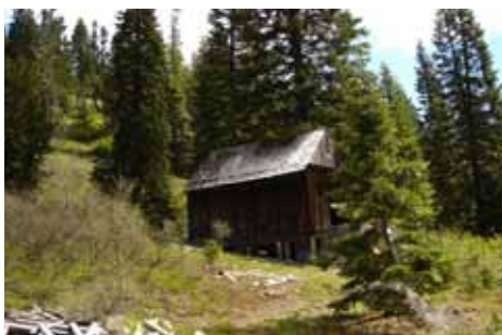
Post office replica at lower Bohemia Saddle Park

The largest park in this watershed is 268-acre Blue Mountain. While it includes an older picnic shelter, the park is otherwise undeveloped. The park's forest is managed sustainably for timber, contributing significant revenues to Parks Division operations while continuing to offer a high quality, passive recreation experience.