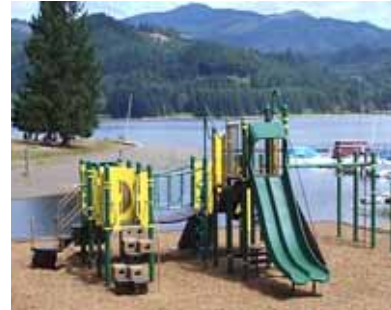
Play structure at Baker Bay

The U.S. Army Corps of Engineers leases hundreds of acres to Lane County for park use, including Baker Bay. The 80-acre park includes a campground, marina, swimming area, and acres of lawn and shade, including two large group facilities. The marina includes 26 slips, and there are 24 on-shore boat storage spaces. The concession sells food and watercraft rentals.