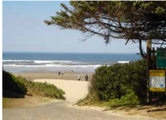
Heceta Beach has picnic tables, parking, a bathroom, and public beach access

Recently, 84 acres of foreclosed property in the Glenada area was transferred to County Parks for revenue generation purposes. This land will be conveyed to Oregon Parks and Recreation in the near term, so it is not included in the county parklands inventory.