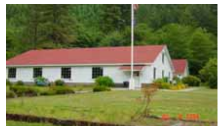
Old McKenzie Trout Hatchery

Near Leaburg on the McKenzie Highway is the early 1900's-era McKenzie Trout Hatchery. The site is listed on the National Historic Register. Interpretive signs describe hatchery operations and its remaining artifacts. The park also serves as