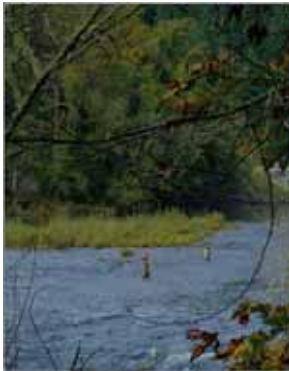
Anglers at Winter Landing (left); ODFW wildlife interpretive sign at Silver Creek Landing (right).

Besides Armitage, Hendricks Bridge, and Ben & Kay Dorris Parks, there are 18 boat landings along the McKenzie River, all owned or maintained by Lane County Parks.