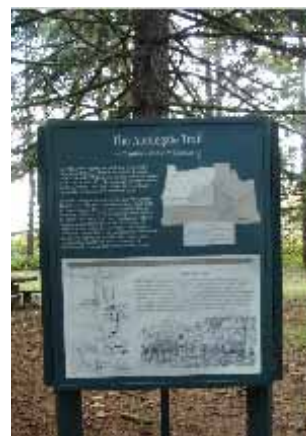
Applegate Trail Interpretive sign at Zumwalt Park