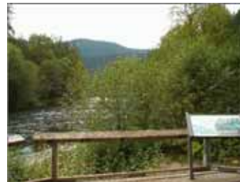
Table **: McKenzie Watershed Parks