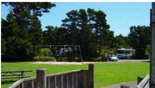
Lane County's Harbor Vista Campground on the Oregon coast is open year round.

Three parks provide temporary camping for group events. At Howard Buford Recreation Area (HBRA), group camping is allowed on a reservation basis. At Perkins and Zumwalt, camping is currently limited to the 3-day Oregon Country Fair weekend. Table ** summarizes camping facilities in Lane County Parks.