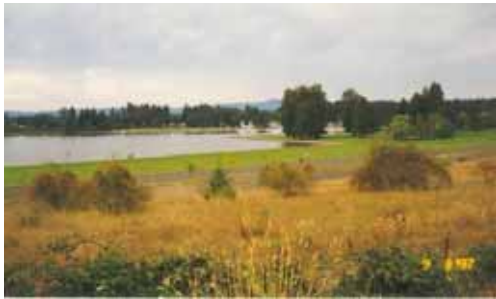
Richardson Park's amenities include a 285-slip marina (above). The reservoir and surrounding marshlands (left) attract hundreds of bird species and other wildlife.