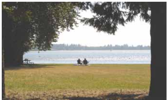
Richardson Park Day Use Area

Three of the parks at the Fern Ridge reservoir – Richardson, Orchard Point, and Perkins, are Class A parks. Besides offering a wide variety of recreational amenities, these parks are easily accessible and close to the Eugene-Springfield metropolitan area to the east, and Veneta and Elmira to the west. As a result, they are the most intensively used lands in the County parks system. All parks along Fern Ridge are on leased lands owned by the U.S. Army Corps of Engineers.