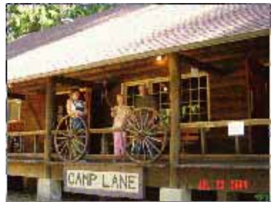
Camp Lane lodge

Camp Lane is a 16-acre historical site on Highway 126 West, 23 miles inland from the Pacific Ocean. The lodge was built by the Civilian Conservation Corp 60 years ago, and is now Lane County Park's only organizational retreat. Its huge stone fireplace, commercial kitchen, and wooded setting on the Siuslaw River make it a popular destination for service clubs, churches, youth organizations, and family reunions. A caretaker is on hand 24 hours a day, and cooking staff are available for hire. Camp Lane has a regulation sized, covered basketball court built by volunteers from the Kiwanis Club. The retreat also has an informal ballfield, volleyball, and a swimming hole on the river. Use of Camp Lane is by reservation only. In the 1950's, it became base camp for workers constructing the highway's Mapleton tunnel. Surrounded by national forest lands, Camp Lane has spontaneously served as a forest firefighting staging area on two occasions.